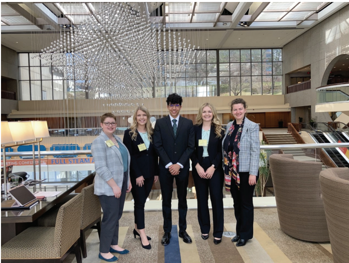
MSU NAMA Team in Kansas City